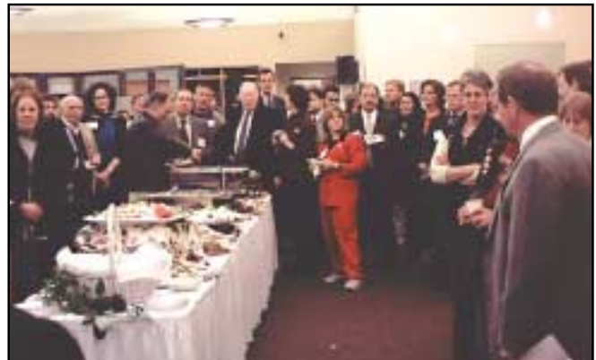
More than one hundred-fifty business professionals attended the January Business After Hours at Northrim Bank's Small Business Center.

THANK YOU TO NORTHRIM BANK FOR HOSTING THE FIRST BUSINESS AFTER HOURS OF THE NEW YEAR. DESPITE THE FRIGID TEMPERATURES OUTSIDE, MORE THAN 150 PEOPLE GATHERED TO CELEBRATE NORTHRIM'S SMALL BUSINESS CENTER.